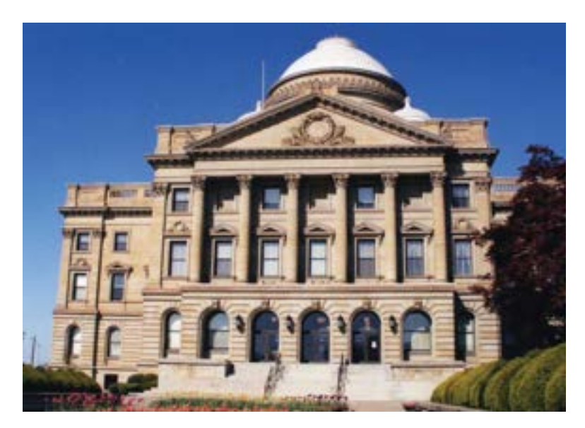
(USPS 322-840) PUBLISHED WEEKLY BY The Wilkes-Barre Law and Library Association

Bar News Must Be Received by 12 O'Clock Noon, Friday for the Following Week of Publication. Legal Notices and Ads Must Be Received by 12 O'Clock Noon, Monday in the Week of Publication.