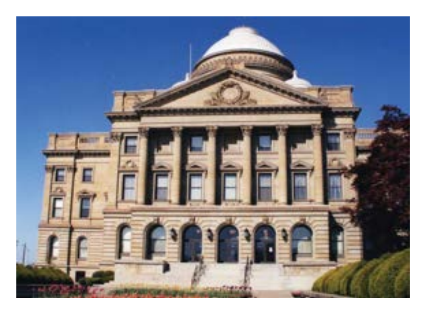
(USPS 322-840) PUBLISHED WEEKLY BY The Wilkes-Barre Law and Library Association

Bar News Must Be Received by 12 O'Clock Noon, Friday for the Following Week of Publication. Legal Notices and Ads Must Be Received by 12 O'Clock Noon, Monday in the Week of Publication.