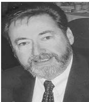
The Lawrence M. Klemow, Esq. Memorial Scholarship Fund of The Luzerne Foundation

Members have individually donated $1,350.00 to the Lawrence M. Klemow, Esq. Memorial Scholarship Fund. At the October Quarterly Meeting the membership voted to match whatever was given up to $5,000.00.