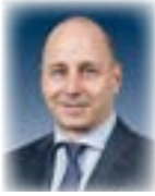
Keynote Speaker Brian Cashman General Manager and Senior VP New York Yankees