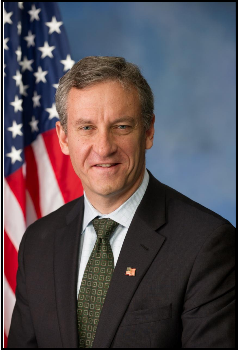
U.S. Congressman Matt Cartwright